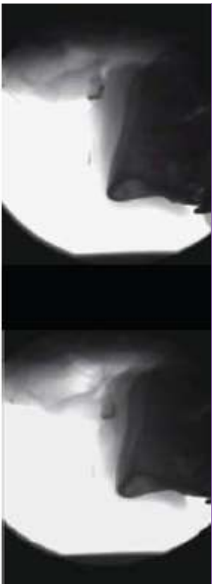
Patient at rest